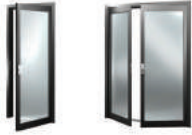
Single door French doors