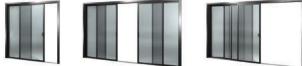
Single slider Double slider Stacking slider